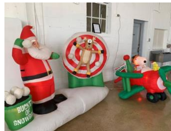
In the meeting room