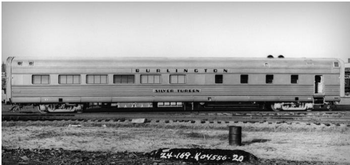
The Silver Tureen diner car

The Division Meet itself started off with a photo presentation by 1 of the Division members featuring his pictures from trip to the USA Pacific North West & to the northern Rocky Mtns. After that was a brief business meeting & a show & tell session. Then most of the Division members went for lunch & then came back to the GA Coastal Ry building to where we got a look at the area into which the Golden Isles club would be moving. Following that, several members, including me, rode the GA Coastal Ry's 1st of 2 excursion trains of the day. I rode on an open-air car (fortunately no rain) the whole trip, pretty rough riding compared to the TCRM Budd cars. This open-air car can be seen in some of the photos on the GA Coastal Ry Website. The RR on which the GC Ry runs its trains is the St Mary's RR. It earns most of its revenue from storage fees collected from various car leasing companies. St Mary's RR also serves a few freight customers, including the US Navy nuclear sub base facilities near Kingsland. GC Ry provides live entertainment during the trip, but there was no car host assigned to work the open-air car. The diesel loco was an ex-ConRail EMD GP15-1..... Budd diner Silver Tureen was part of the consist. I think someone said that GC Ry leases its passenger cars from Ben Butterworth.