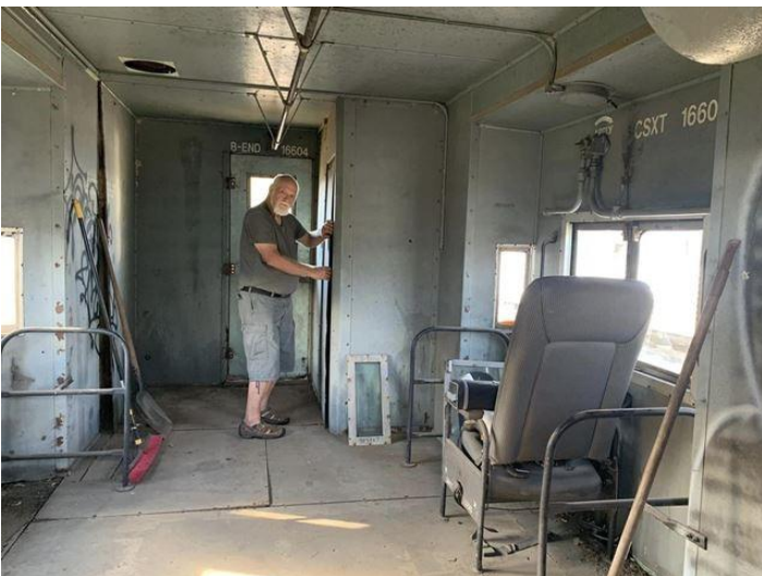
A cleaned up interior of the caboose

The end goal for this Caboose will be a full restoration and to have the caboose back operating on occasional museum excursions.