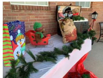
On the dock