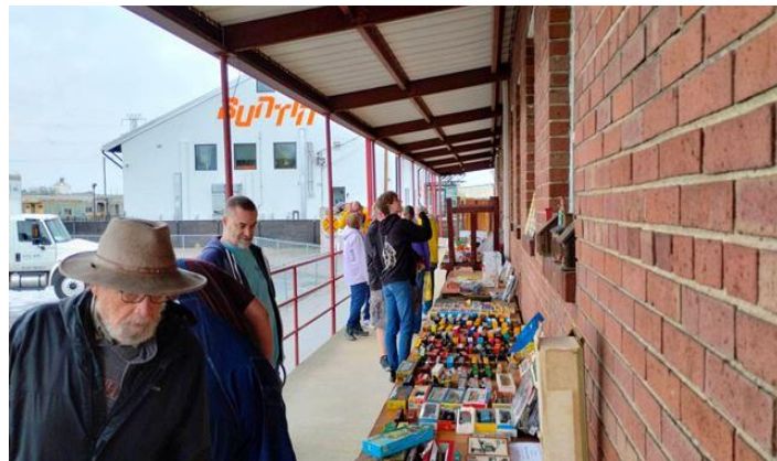
2022 Fall Open House – Tables on the dock