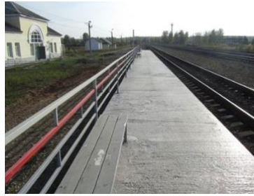
New concrete on the platform – view to the south

What different departments planned to do in order to present the station as a Benchmark station remained only in the plans and was not done.