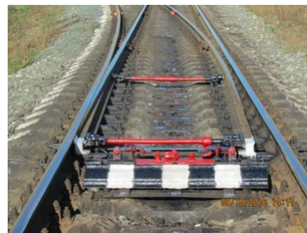
The switch with fresh paint

I began to bother the heads of various departments (track