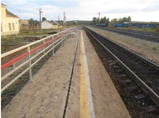
The old platform at the Chur Station

explain what has been done and what has not been done, what needs to be done, where what documents are located, as well as the features of the station.