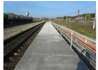
New concrete on the platform – view to the north

What different departments planned to do in order to present the station as a Benchmark station remained only in the plans and was not done.