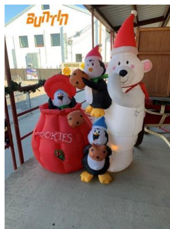
On the dock