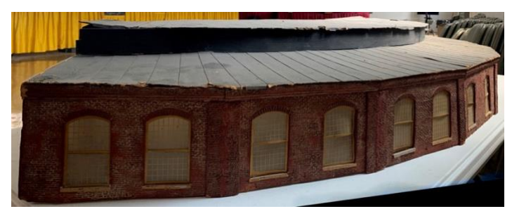
The round house

Two of the donated structures are pictured below. One is the Roundhouse, and the other is a Hotel, but which one? What is so interesting about these structures is that the named businesses sponsored the structure, so their name could be on the layout. But most buildings have lost their corporate branding. Come down to the museum. Take a look at the structures and help us identify the buildings. And help us determine the best way to make an informative attractive display.