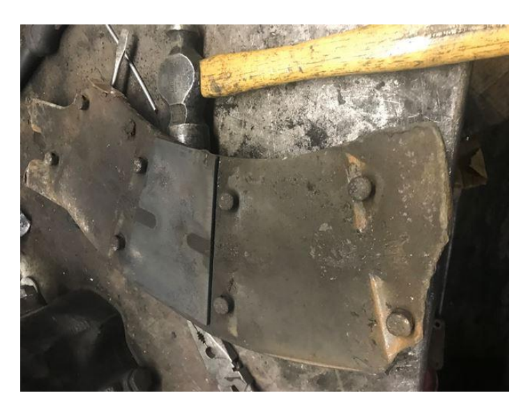
This picture shows the worn disc removed from the main backer assembly. The six visible pins align the new disc brake replacement. There are holes in the alignment pins. Wire is driven through two opposing pins to hold the replacement pads in place.

backer plate while the disc is being repaired and what a new disc brake looks like.