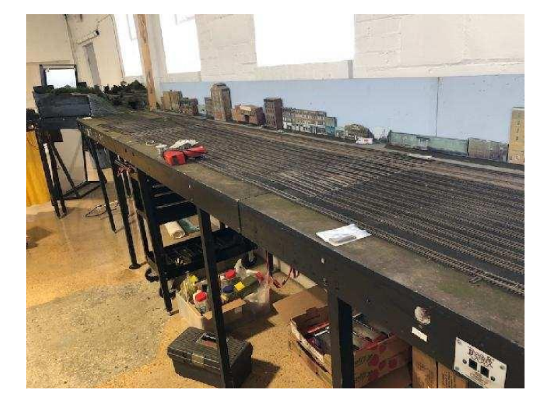
Our first operation in front of guests was on July 16th for the Watertown Murder Mystery Jazz Festival Excursion. Gary Sagaser ran the layout as people were waiting to board the train.

After weeks of adjusting, repairing, and improving, a train was finally run around the complete layout.