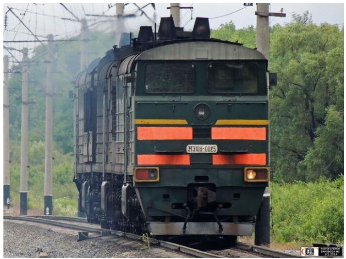
Same type of locomotive in the same area, but in summer time instead of winter

But suddenly the operator called me on the internal phone and asked me to come right away. When I came to the station operator room, he told me that the train #4303 had emergency stopped to avoid hitting a man. Fortunately, it was only a freight locomotive without any cars, and the engineer was able to stop the engine quickly.