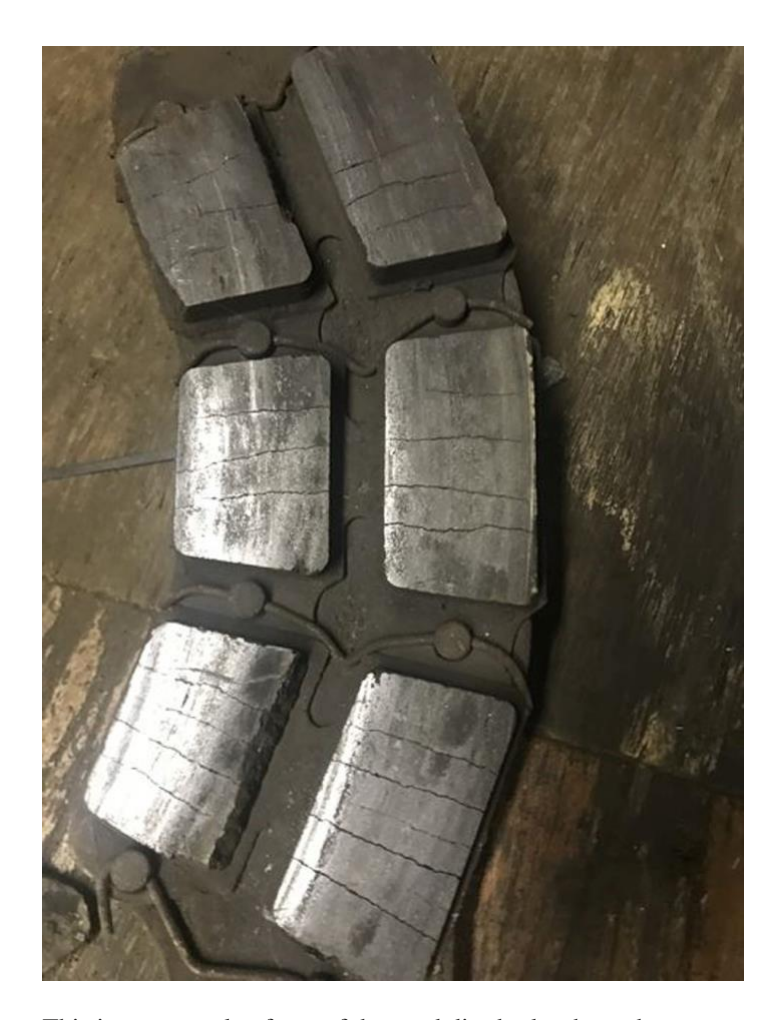
This is an example of one of the used disc brake shoes that most of our equipment takes. I thought members would be interested in seeing the used disc brake along with a picture of the main

backer plate while the disc is being repaired and what a new disc brake looks like.