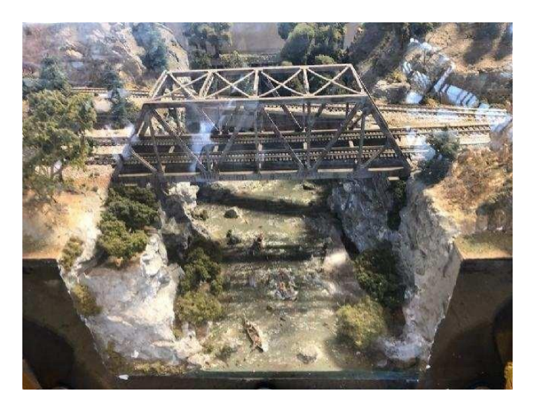
There is one module that does not have any scenery on it. This module is open for anyone that wants to build structures, or add scenery.