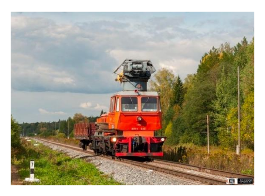
"The same maintenance diesel car as in the story"

The second story have happened just after my promotion to the station master in the Uski station at the end of July 2014. At the beginning of second week I went to the station operator office and she told me that she had just received information from the engineer of a maintenance diesel car that they had hit two teenagers and needed an ambulance. I remembered the previous situation and I immediately called 112.