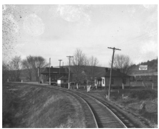
Carthage Junction Depot – 1930s

The most common way of describing rail is in terms of its weight per linear yard (the historic British unit of length), which is a function of its cross section. In the late 19th century, rail was produced in a range of sections weighing between 40 and 80 lbs. per yard. Weights increased over time, so that rail rolled today weighs between 112 and 145 lbs. The rail below from the Carthage branch is on the light side at only 60 pounds per yard. By comparison, the track between Nashville and Lebanon today has rail that is 115 pounds per yard - that's almost double the size.