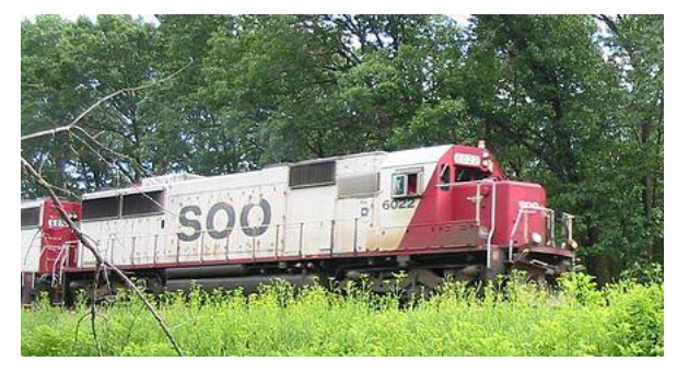
SOO line 6022 pulls a train through Wisconsin Dells, 2004

Being a stockholder in both Soo Line and Missouri Pacific (MP) Railroad I had access to their annual reports. I noticed that MP was continuing work on their state-of-the-art Transportation Control System (TCS). Progress continued adding a variety of addition functions to TCS, including train crew assignments, reporting and scheduling, in addition to many other functions, including their car scheduling which created a "trip plan" for every car (and locomotive) on the railroad. However, the mergers of the 1980's affected a lot of class one railroads, and the "Mop or MoPac" was not an exception. On December 22, 1982, the MoPac merged into the Union Pacific (UP) Railroad, and I became a Union Pacific Corporation/Railroad shareholder.