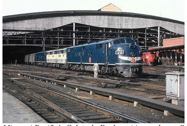
Missouri Pacific's Colorado Eagle waiting to depart St. Louis Union Station, 1963

Being a stockholder in both Soo Line and Missouri Pacific (MP) Railroad I had access to their annual reports. I noticed that MP was continuing work on their state-of-the-art Transportation Control System (TCS). Progress continued adding a variety of addition functions to TCS, including train crew assignments, reporting and scheduling, in addition to many other functions, including their car scheduling which created a "trip plan" for every car (and locomotive) on the railroad. However, the mergers of the 1980's affected a lot of class one railroads, and the "Mop or MoPac" was not an exception. On December 22, 1982, the MoPac merged into the Union Pacific (UP) Railroad, and I became a Union Pacific Corporation/Railroad shareholder.