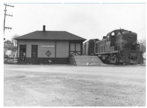
South Carthage Depot, March 1958

Editors note- The best way to appreciate these displays is to come down to the museum. We cannot show them full size in the Order Board format. However, we have extracted the pictures and text on each display to at least share the information and pictures used on the display.