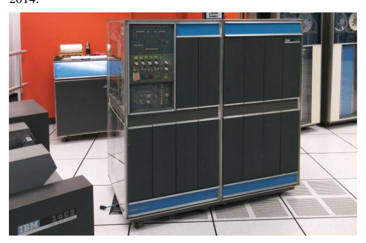
IBM 1401 main frame from 1959

In the 2012 ComputerWorld Magazine (a good resource for programmers) it was mentioned that under a new Chief Information Officer/Technology Officer – CIO, CTO) the MP/UP TCS system was developed in a lot of IBM Assembler language and the MP custom RAIL language (similar to Assembler language) and that younger programmers did not have the knowledge and skills to maintain or enhance those programs. While doing research I found documentation stating that the UP IBM mainframe system was "junk" compared to the MP TCS System. The article in 2012 stated that the CIO in charge of UP then stated the systems would all be rewritten into more newer systems and languages with graphical user interfaces (GUI) by 2014.