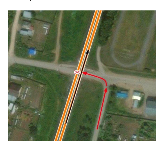
The scheme of the incident, black arrow is the movement of maintenance diesel car, red arrow is movement of these boys on the scooter"