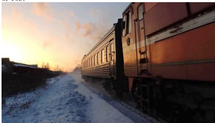
"A commuter train between Vozhoy and Pozim stations"

After people started to use cell phones, the phone numbers were changed to 101, 102, 103. And at the same time there was an organized and unified dispatch service 112 (like 911 in the USA). So now, in Russia, you can call 112, or direct 101 or 102 or 103.