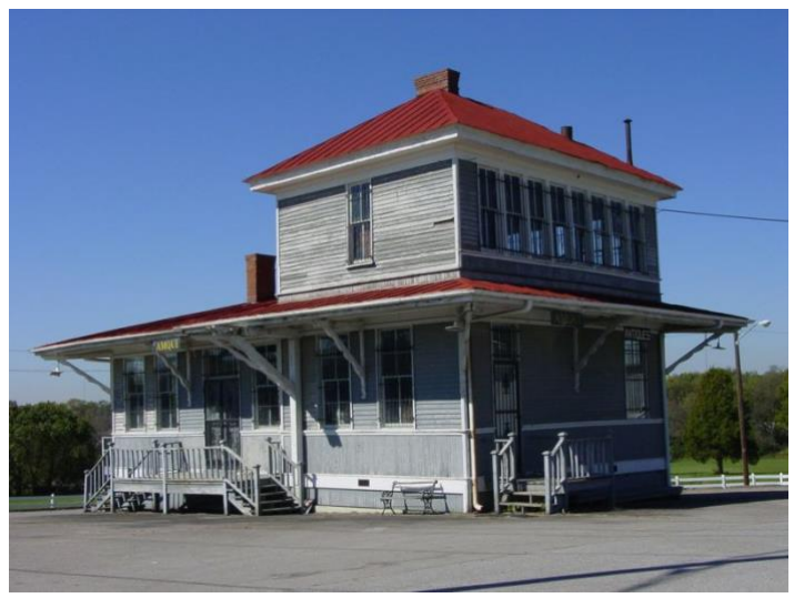
Amqui Station building at the House of Cash, from the Amqui station.org