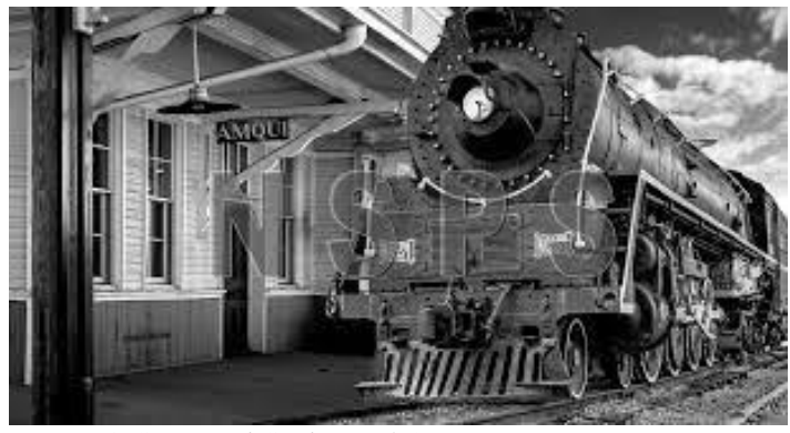
From NSPS. Amqui Station and 576