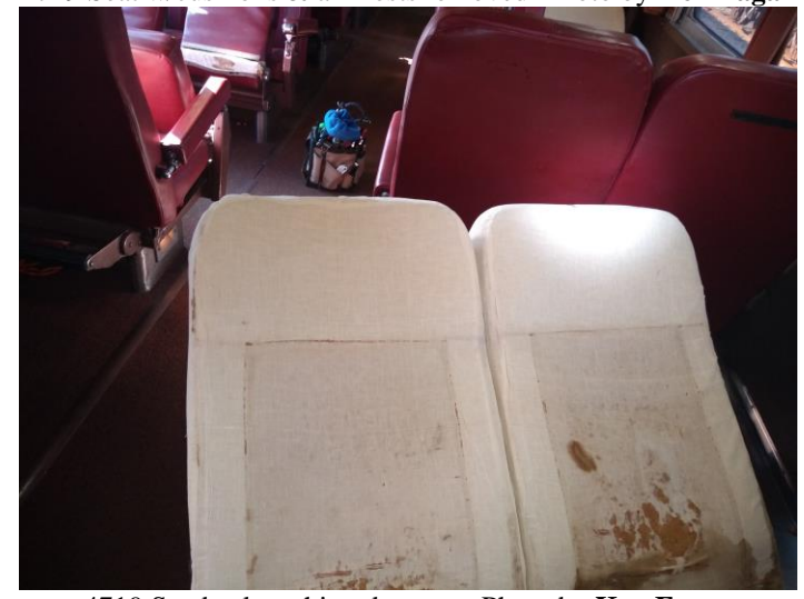
4719 Seatback cushion damage

Ken Fagan has also installed locks on the glass display cases that are in the Company Store area in the meeting room. Hank Sweetman plans to place some Hobby Shop items in those display cases to let our Excursion passengers know that we have a Hobby Shop and there are items for beginners as well as expert railroad modelers.