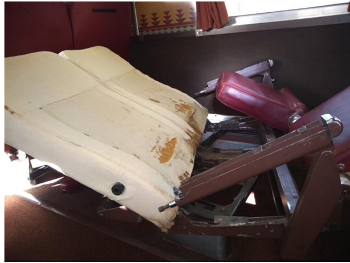
4719 Seat w/cushions & armrests removed