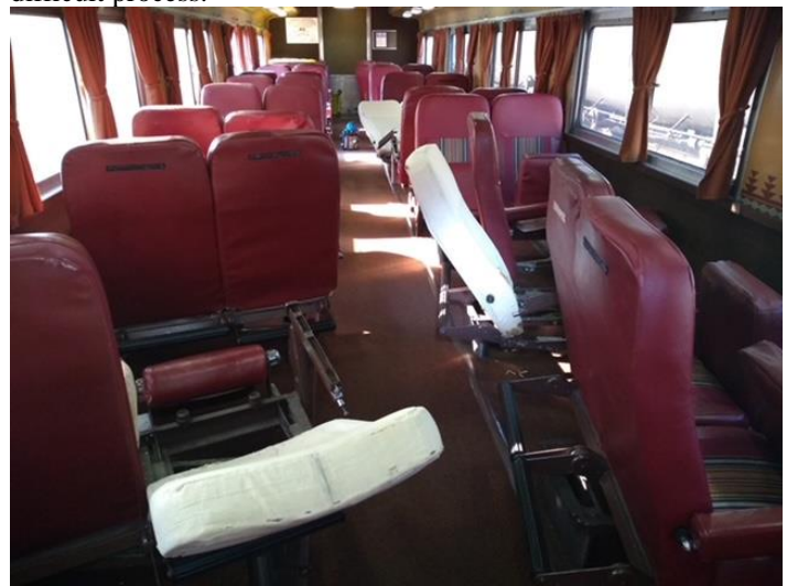
4719 Seat renovation

Randal Brooks and Ken Fagan have been working on getting seat cushions, armrests and footrests repaired. They have to remove the components and take them to Rogers Seat Cover Co, and then replace them in the cars. This is a long, tedious and difficult process.