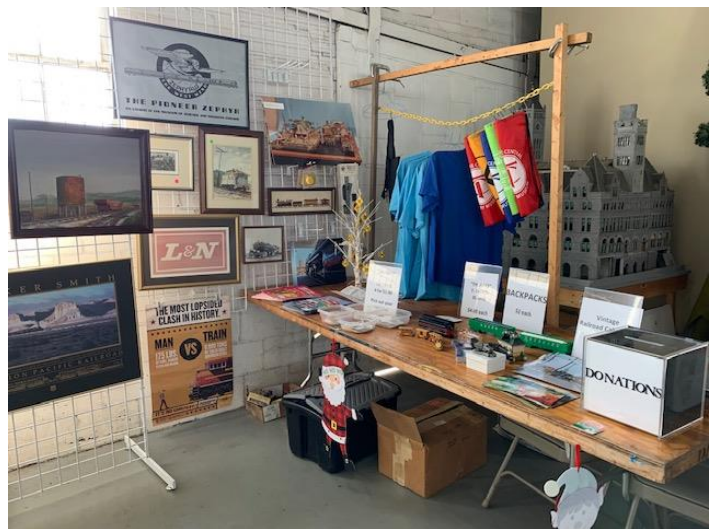
3 TCRM Company Store.