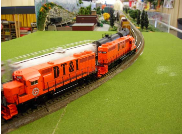
View of Bob Hultman's Athearn DT&I SD38 252 in the lead and Athearn GP35 350 trailing as they pull a train on the ouside main track at the Cumberland Valley Model Railroaders HO modular RR set up at the Tennessee State Fair. The train is traveling over one of the new corner modules built by Pete Boehme and will be entering onto Len Hollinger's 16' Firestone module group.