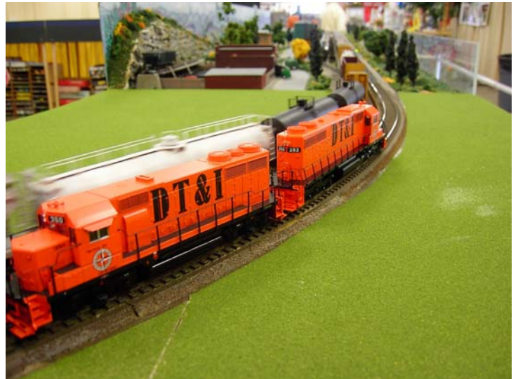
View of Bob Hultman's Athearn DT&I SD38 252 in the lead and Athearn GP35 350 trailing as they pull a train on the outside main track at the Cumberland Valley Model Railroaders HO modular RR set up at the Tennessee State Fair. The train is traveling over one of the new corner modules built by Pete Boehme and will be entering onto Len Hollinger's 16' Firestone module group.